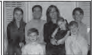
The Zampiello Family