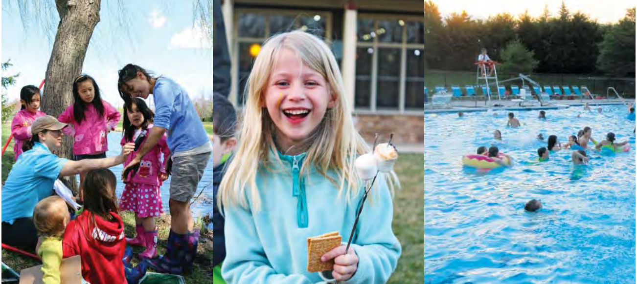
As seen in our neck of the woods