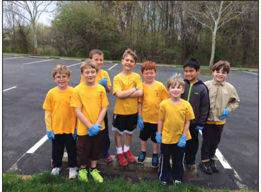
In late April, Cub Scout Den 1 collected four bags of trash around the Community Pool. All this trash came from the cemetery and swamp. Great job Cub Scout Den 1, thanks for helping to keep Broadlands beautiful!

For more information about the lecture or the Loudoun County VCE Master Gardener program visit the website: loudouncountymastergardeners.org or call the Loudoun Extension Office at 703-777-0373.