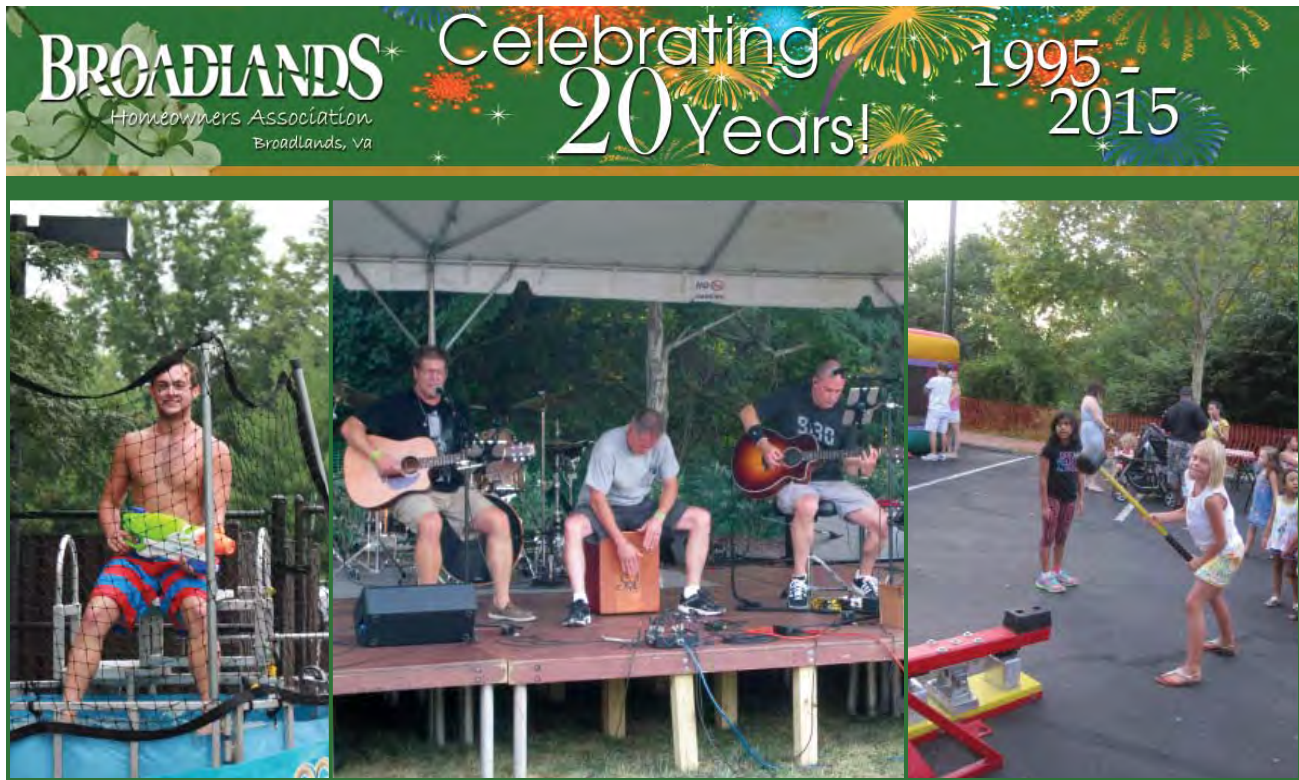
As seen in our neck of the woods