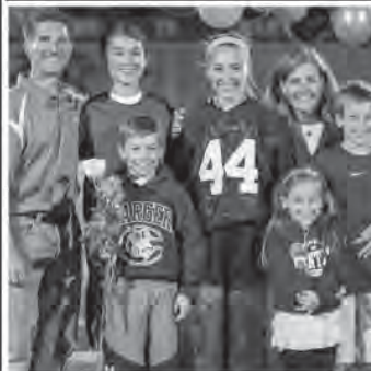
The Zampiello Family

We understand & can help make it look new again!