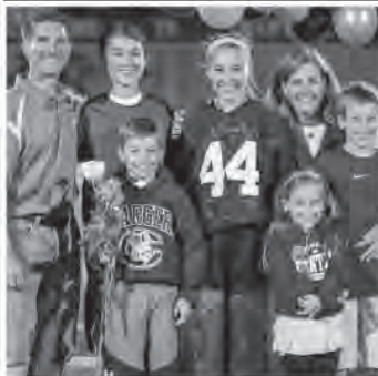
The Zampiello Family

We understand & can help make it look new again!