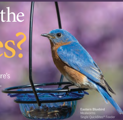
Eastern Bluebird Mealworms Single QuickBites® Feeder

Attract bluebirds! One of Mother Nature's most cheerful birds.