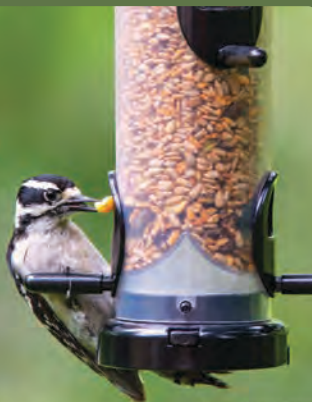
Downy Woodpecker Flory Feast® EcoClear® Medium Seed Tube Feeder

Offer our exclusive hot pepper bird foods and keep critters away from your feeders.